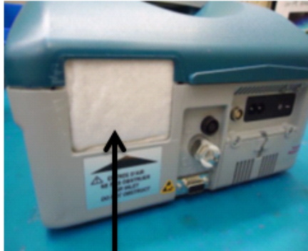
Proper placement of air inlet Filter

Humidifiers: heated humidifier with bedside set up; a Heat Moisture Exchanger is used with chair set up when no Passy Muir Speaking Valve is in use